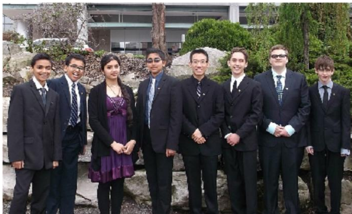
WWSEF Finalists at the Canada-Wide Science Fair in Windsor...see inside